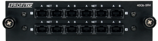
40G: F4MY-SR4 / 100G: F4MY-SR10

ProfiTap® MTP fiber optic TAPs are designed to enable flawless in-line monitoring of 40G and 100G fiber optic networks. Our MTP TAPs use some of the most advanced fiber optic technology available in order to bring you exceptional density and performance within an exceptionally compact footprint. We ensure instant, optimized use of your 40GBASE-SR4 and 100GBASE-SR10 networks with complete traffic visibility, zero downtime, zero packet loss, and no point of failure.